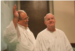
Men's Prayer Breakfast Every 2nd Saturday of each month. April 9 at 8 am